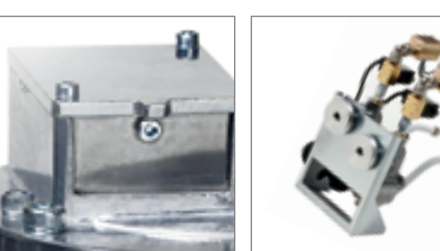
VAPOUR RECOVERY SYSTEM eM